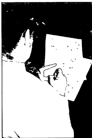
Write that point!