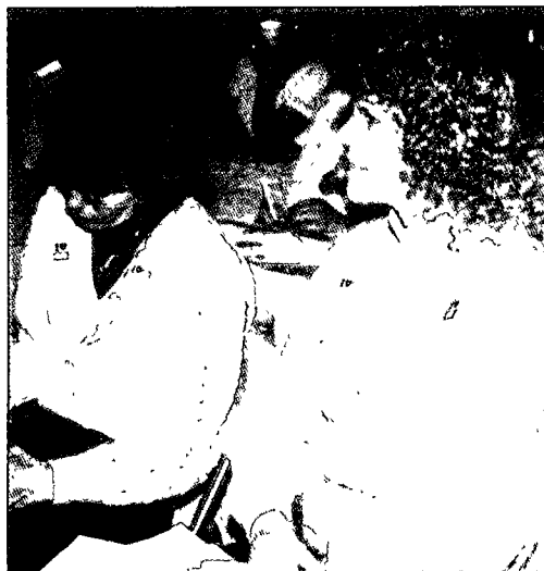
My life really does count.

If your District or Division is interested in a Christian Education Training Conference, call or write your District Office or the National Department of Christian Education.